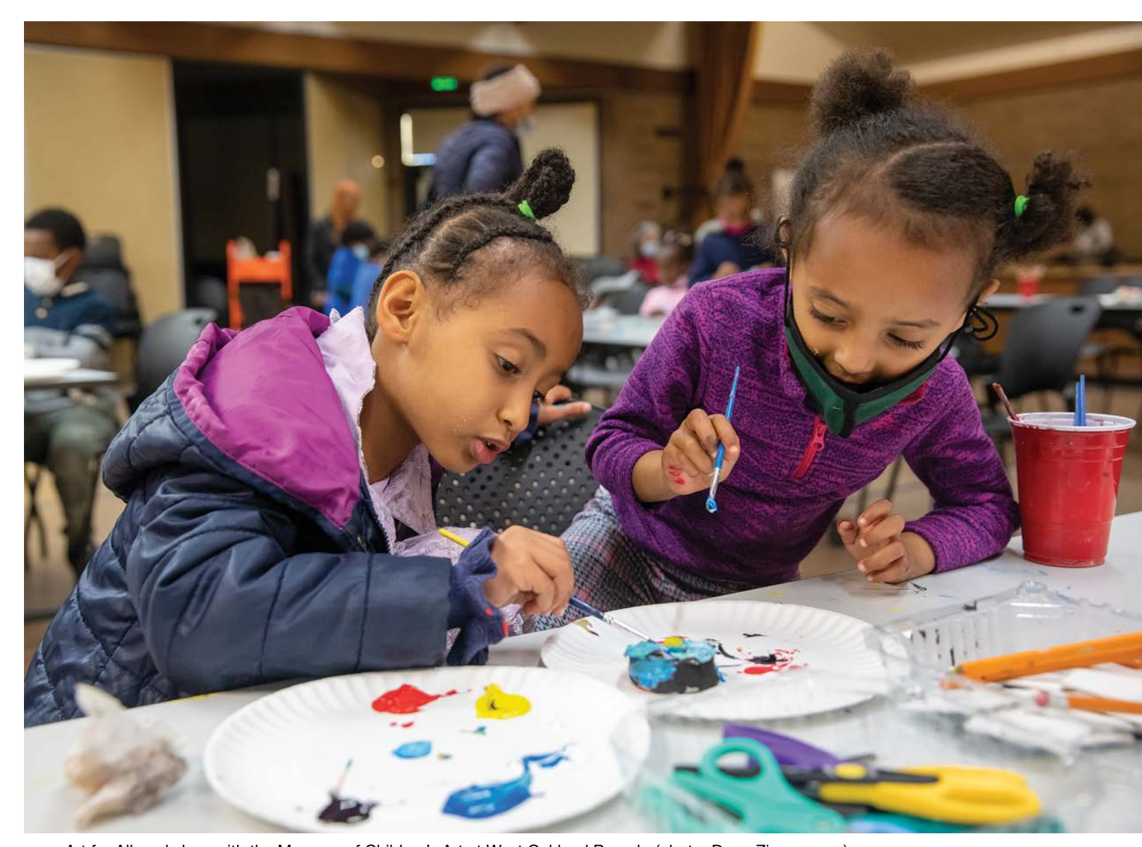
Art for All workshop with the Museum of Children's Art at West Oakland Branch.

Art for All is supported in part by funding provided by the State of California, administered by the California State Library.