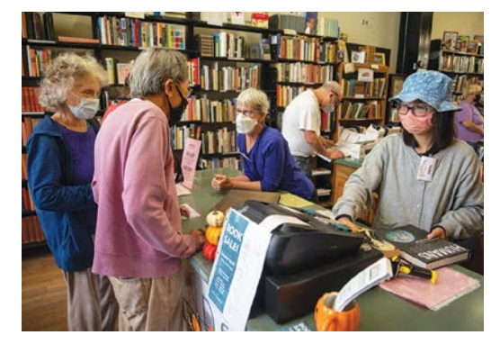
Volunteers help shoppers at The Bookmark.

As was true for most small businesses, the COVID-19 pandemic presented existential challenges to The Bookmark. The store weathered this difficult time