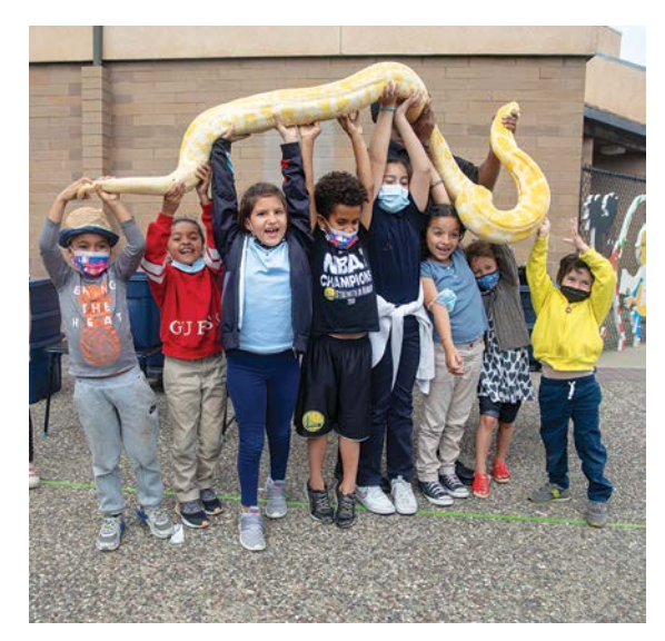
Fur, Scales, and Tails at West Oakland Branch.

Summer 2022 was an especially exciting time, as we provided 198 inperson programs for children and 124