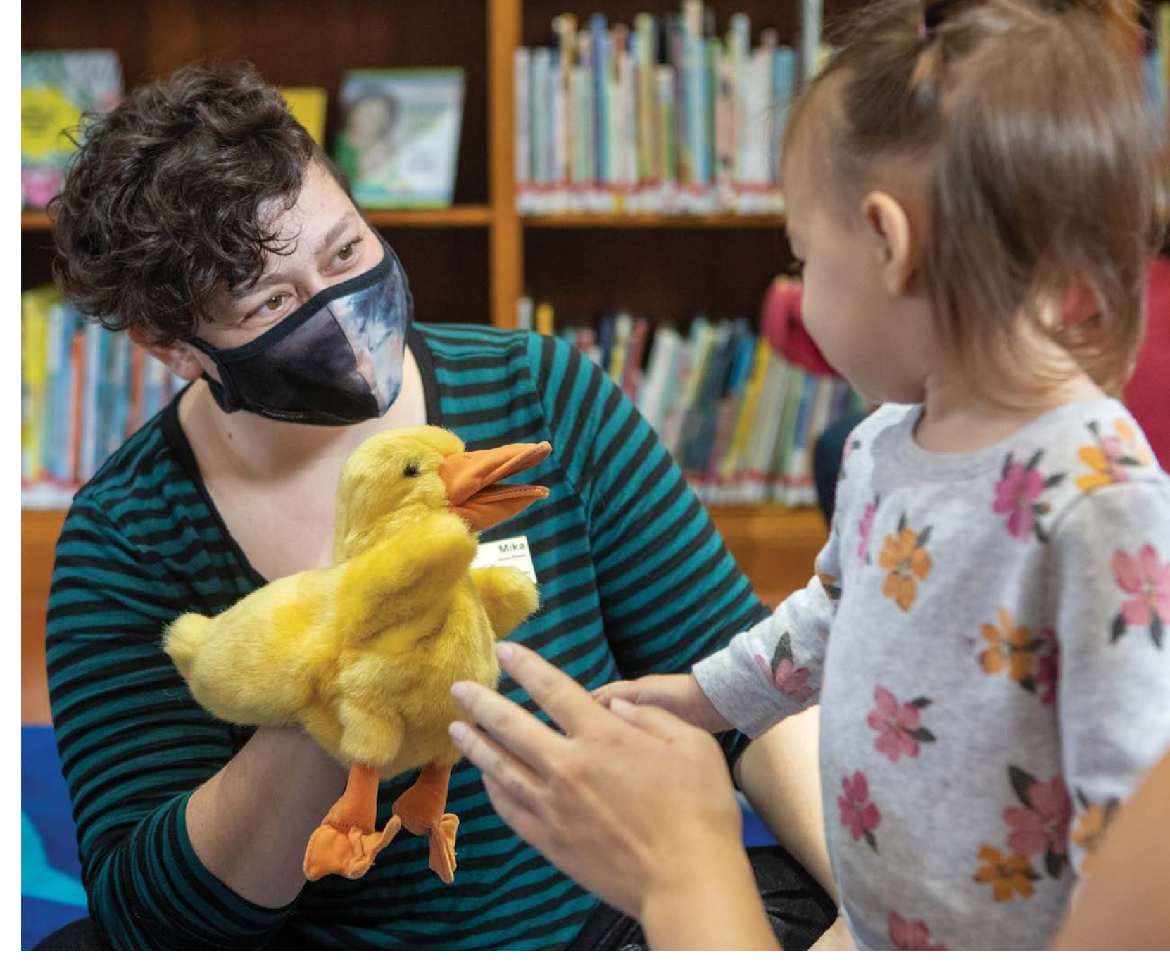
A storytime at Golden Gate Branch.

OPL was pleased to once again bring our library community together for engaging events and programs in 2021-22. We look forward to more in the year ahead.