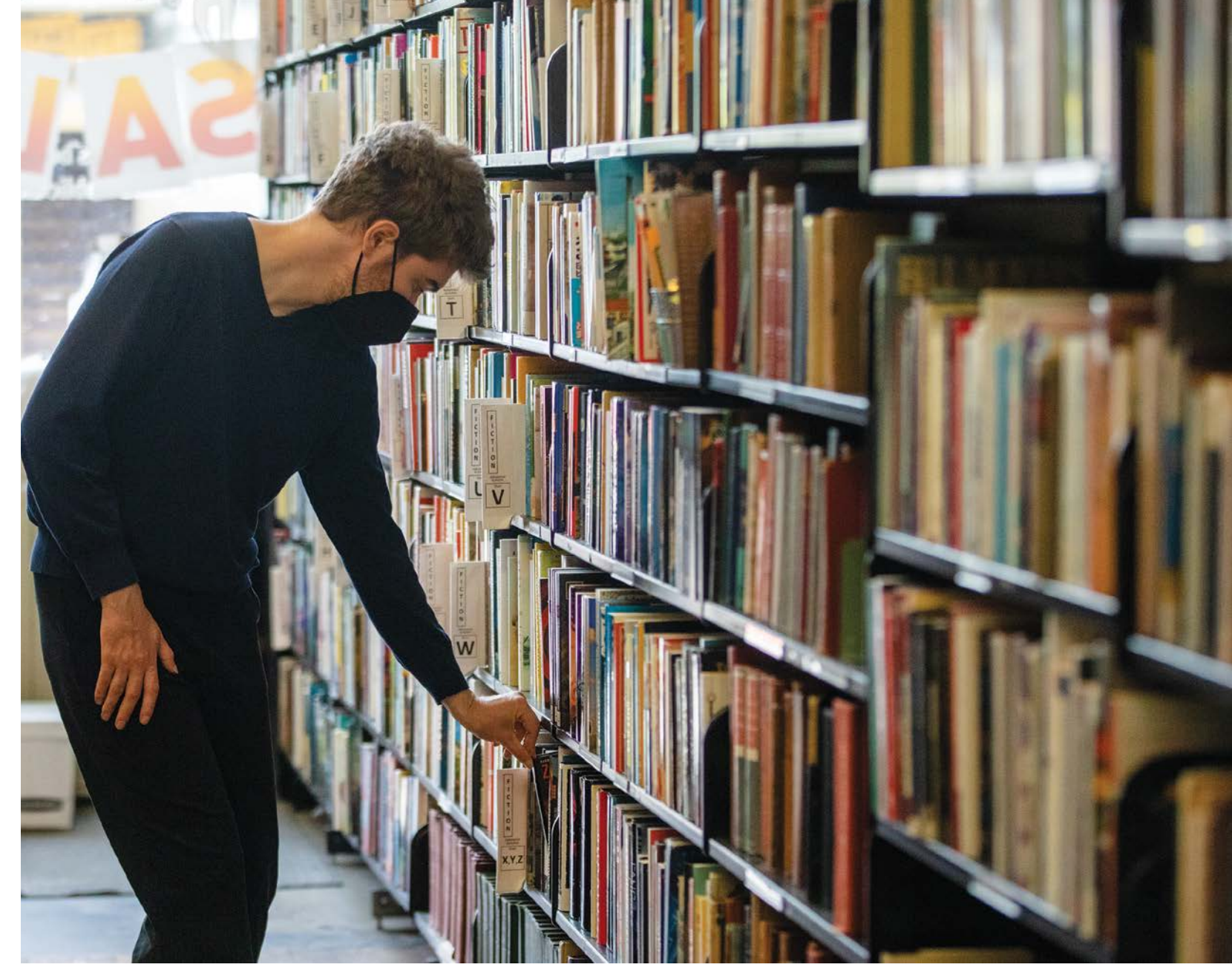
The Friends of the OPL Bookmark Bookstore at 721 Washington Street in Oakland.

OPL celebrates The Bookmark Bookstore and the hundreds of dedicated and inspiring volunteers who have contributed to its success over the past 30 years. To learn more about donating, shopping, or volunteering, visit FOPL.org.