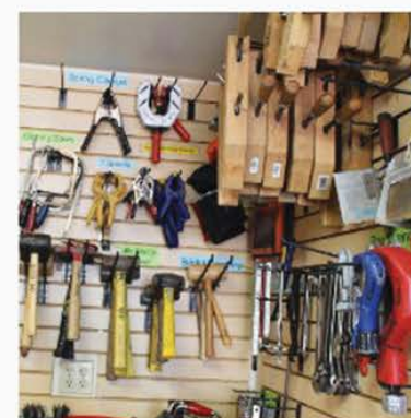
Oakland Tool Lending Library

Dedicated to the discovery, preservation, interpretation and sharing of historical and cultural experiences of African Americans in CA.